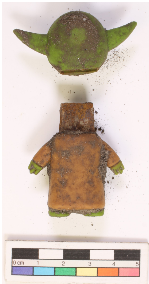
Figure 2: Back of the figurine