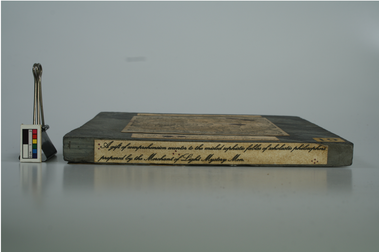
Figure 3 One labelled side of the fossil