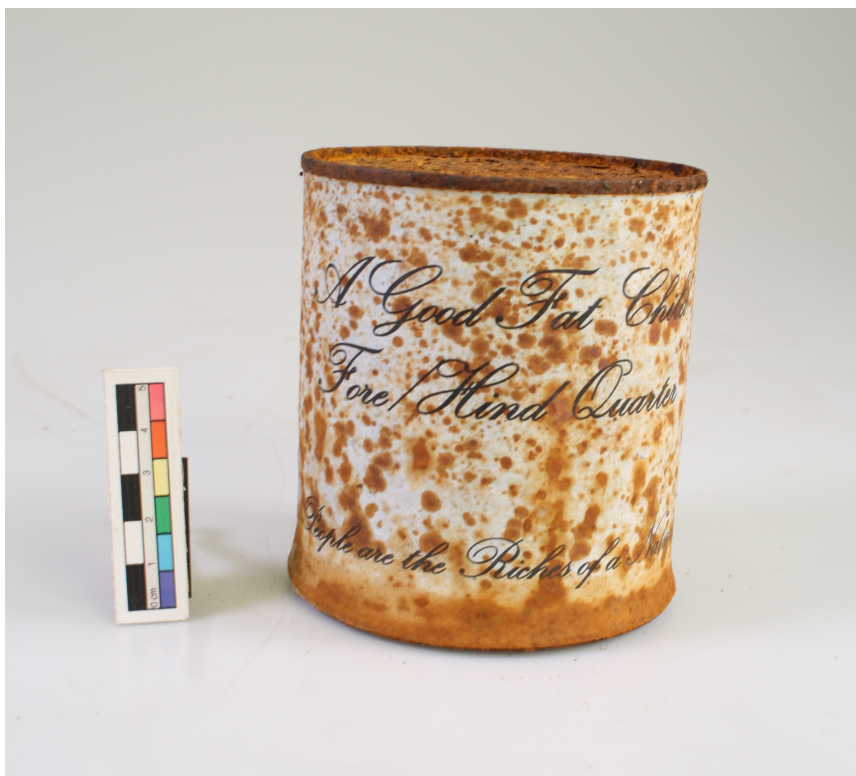
Figure 1. Front image of can. Caption: A Good Fat Child. Fore/Hind Quarter. People are the Riches of a Nation. Shows evidence of the rust seeping through the paper label from underneath, with more damage to the label at the bottom of the can.