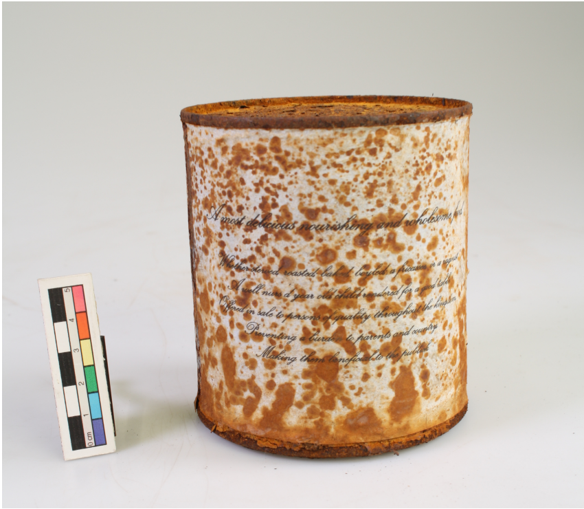
Figure 2. Rear image of can. Caption: "A most delicious nourishing and wholesome food. Whether stewed, roasted, baked, boyled, a fricassee or a ragoust. A well nourished year old child rendered for a good table. Offered in sale to persons of quality throughout the kingdom. Preventing a burden to parents and country. Making them beneficial to the publick." Writing not quite legible, because of the rust damage to the paper. Shows the break in the paper label on the left and right sides. There is a line of flaking rust around the bottom edge of the label that needs to be conserved.