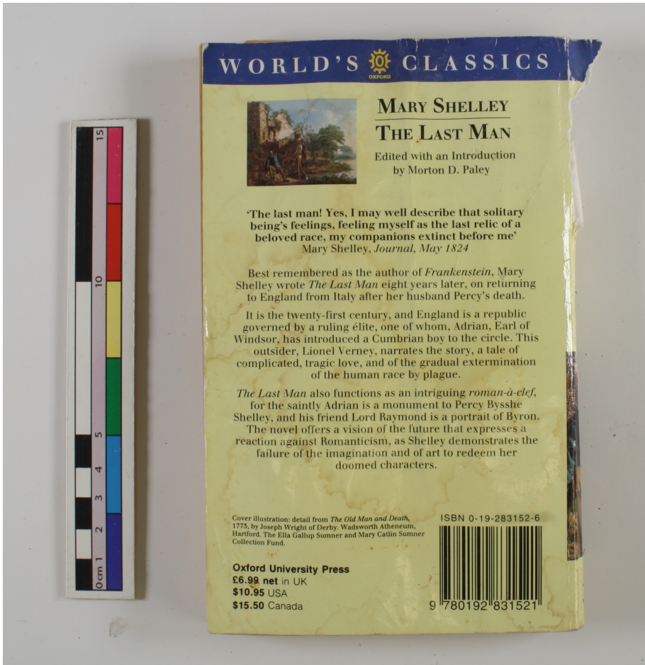
Image 2. The back cover of the object, showing its nearly intact wrinkled cover with brown staining throughout. The torn edges of the cover along the upper right edge of the book are visible. The most visibly prominent wrinkle in the cover is visible on the upper right area, ending at the “y” in the word “solitary” and extending upwards. The top left corner of the cover shows a small white area of wear where the blue pigment has worn away.