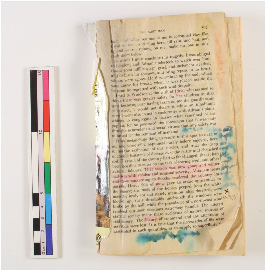
Image 1. The front page of the book; the wrinkled pages and folded corners are visible, as well as the area of abrasion in the top left corner. Printed text in black pigment is visible as well as faded and diffused writing in pink, blue, and orange. The torn edge of the cover is visible along the spine as well as the glossy surface of its remnants. The inconsistent yellow coloring of the page is visible, especially in the top right corner (grey) as well as the bottom right-central area.