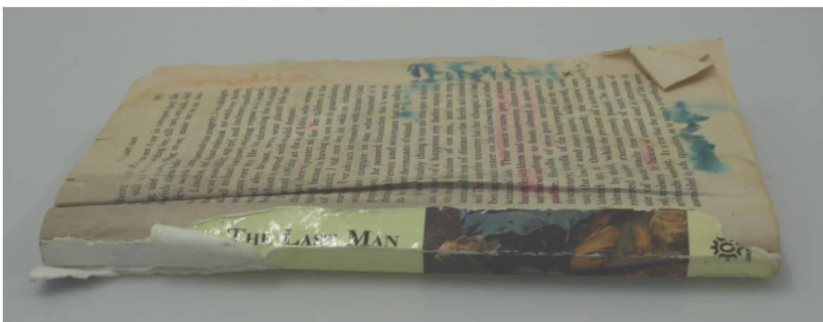
Image 3. The edge of the object, showing where the cover is torn and peeling away from the spine. Shows details of the folds in the front few pages, and the coloured stains.